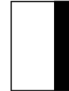
Third Page Vertical