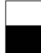
Half Page Horizontal