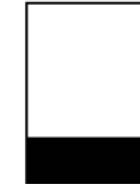
Quarter Page Horizontal